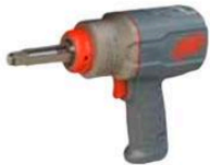
2236QTIMAX-2 2" Extended Friction Ring Anvil

Titanium Hammer Case Lightweight with unyielding durability