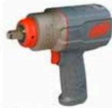
2236QTIMAX Standard Friction Ring Anvil