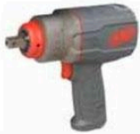
2236OPTIMAX Standard Pin Anvil