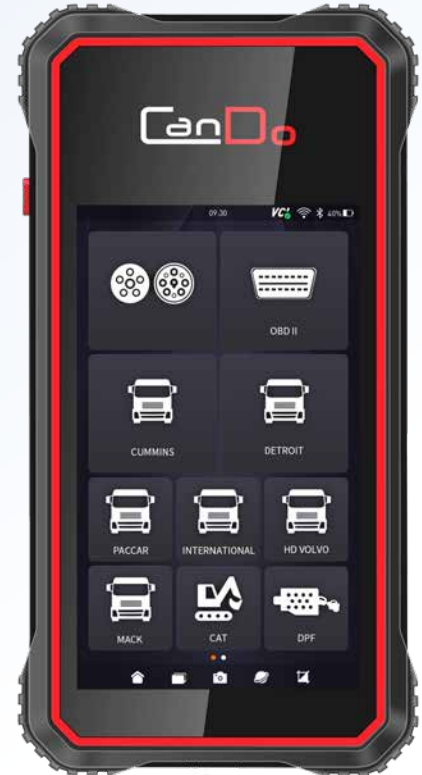
HD CODE III